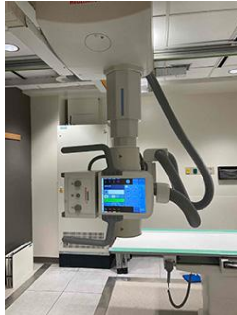
Ascension St. Vincent Xray 6 Indianapolis