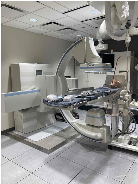
Ascension St. Vincent Xray 9 Indianapolis