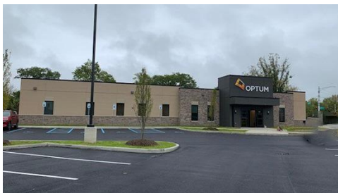
American Health Network/Innovcare New Construction Indianapolis