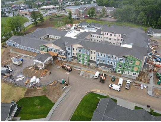
Legacy Living Assisted Living 147,000 SF New Facility Florence, KY