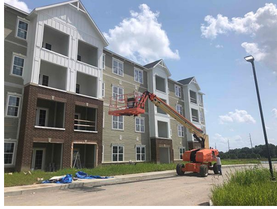
Harmony Assisted Living 204,000 SF New Facility Avon